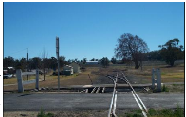
Recently completed work at the former station site

The Stanthorpe to Wallangarra line was closed late last year after severe fires ripped through the region and damaged infrastructure, and this marks a significant step in restoring heritage rail access and promoting tourism in the Granite Belt region.