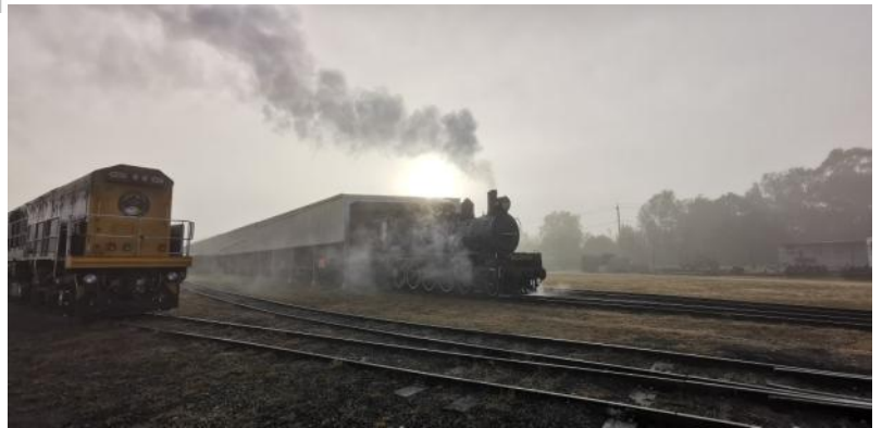
Old and new - Watco's powerful freight hauler and No 974 on an early morning start in Warwick yard

THE WALLANGARRA LINE Seeking your help in lobbying your representatives to re-open this important piece of railway history. Let them know your feelings! THANK YOU