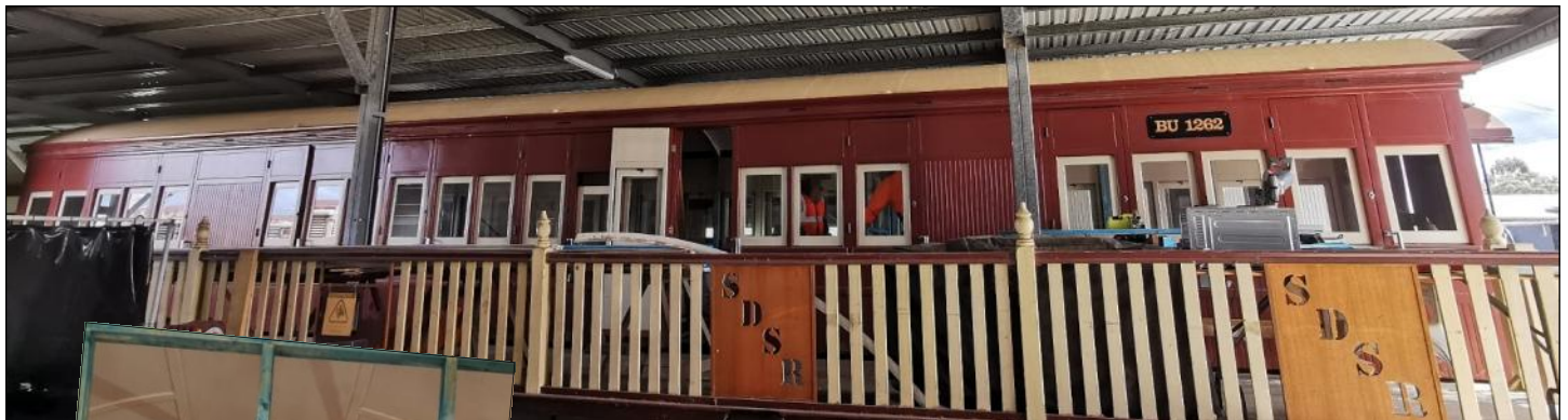
'Evans car' BU 1262 undergoing renovation. The old girl has mechanical issues and doesn't fit so well with our walk-through train layout. So, in a new lease of life it will have sleeping accommodation for our crew who often have to be on site at 4:00am