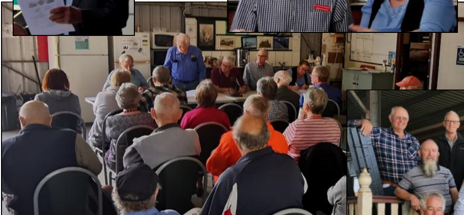
SDSR Management Committee for 2021/22 Probably the most members we have had to date