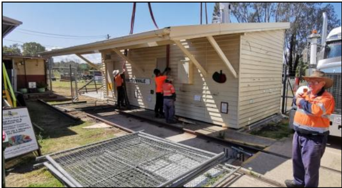
Next, Cottonvale Station gets lifted from its site alongside the main track, put onto a truck and driven around to the front entrance, where it becomes a new focal point for visitors. The original Parcel Shed will now go alongside, to the left.