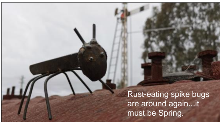
Rust-eating spike bugs are around again...it must be Spring.

Our engineering Dept is very excited that we were successful in securing a State Gambling Fund grant to allow us to install a heavy lifting gantry crane and associated heavy jacks and gear.