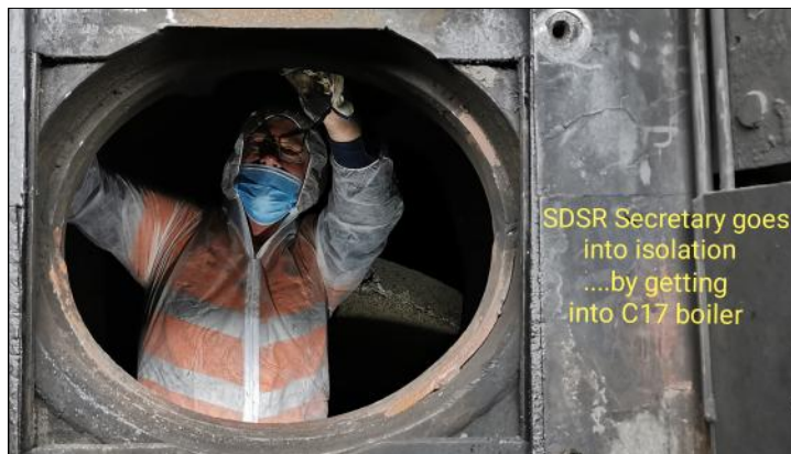
SDSR Secretary goes into isolation ....by getting into C17 boiler